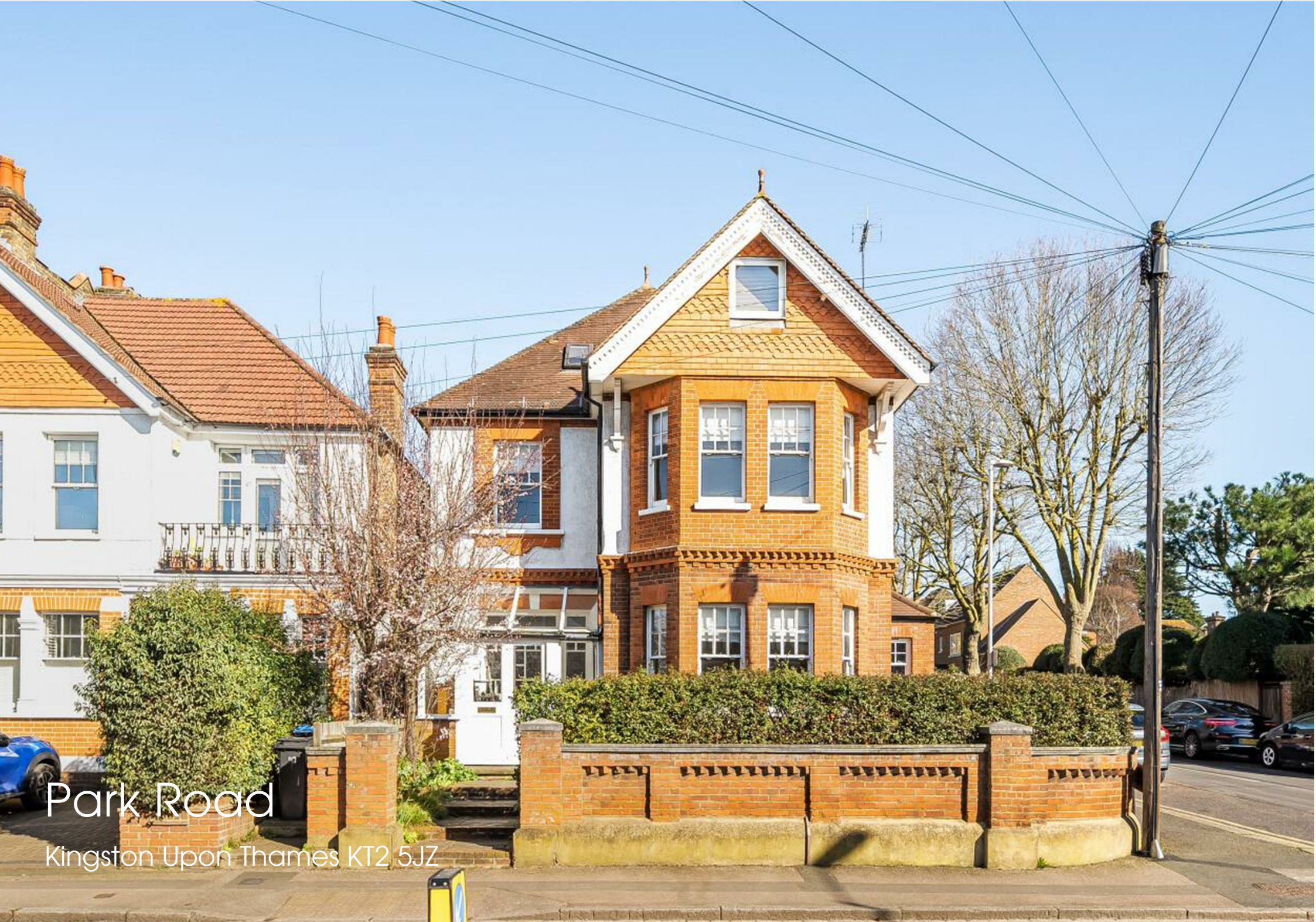
Park Road Kingston Upon Thames KT2 5JZ